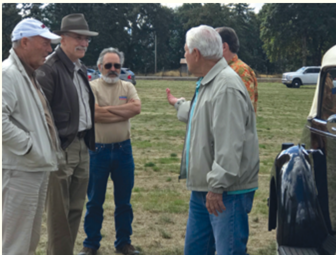
A ravenous round-up of Packard perennials asked, "Where's the Chicken?"

The event hosted hundreds of cars from the 1910s through the '80s with many hot rods and muscle cars. Over by the church were a number of booths set up which featured food items