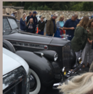
Line to the shuttles for the first event of Monterey Car Week.