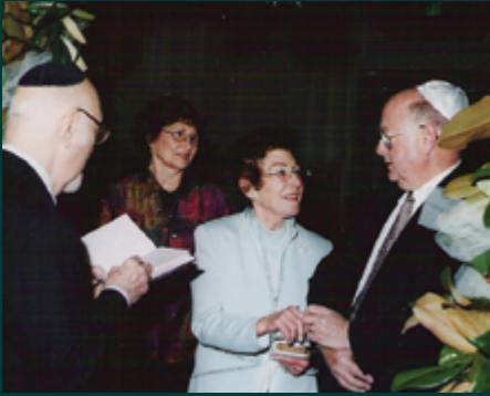
The 50th wedding anniversary celebration with family.