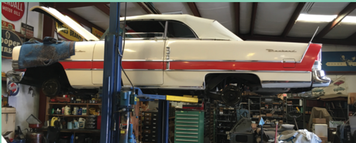
A 1955 Packard Caribbean Con- vertible Coupe gets a complete brake overhaul.