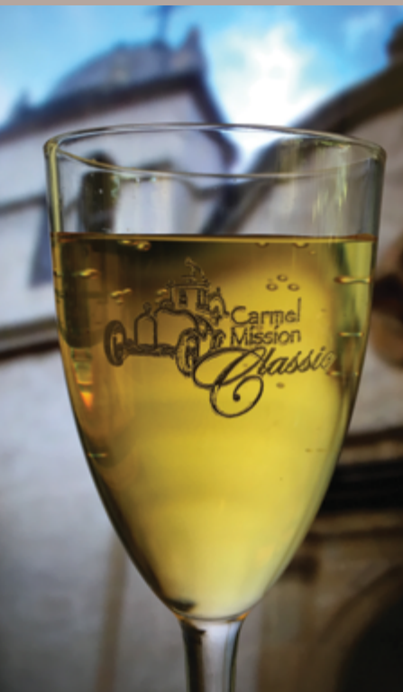
Souvenir wine glass with admission, followed by tastings from local wineries.

Tours of the Mission and its museum took you back in time before the Gold Rush when all of California was occupied by Native Americans and Spanish/Mexican settlers, clergy and military. Being immersed in the thick, dark halls of artifacts heightened awareness of Hispanic influence everywhere, in California location and city names, cuisine, architecture and customs.