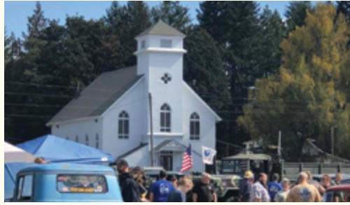
Our Lady of Lourdes Church

such as baked goods along with many arts and crafts type items. We all walked around admiring the multitude of autos and conversing with car owners about their particular vehicle.