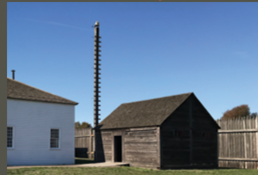
The jail - behind the counting house.