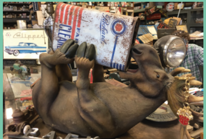
Moose Motors mascot.

After he adjusted my brakes and hand-brake, I was off, finally confident in my stopping power and thankful he was able to interrupt his schedule to take care of the Duchess.