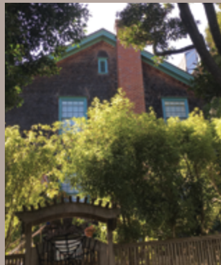
The home of O. K. Cushing from 1889 to 1948.