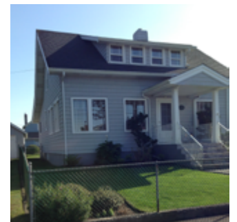
Napping with Bitsie at the cottage in Seaside, her favorite spot at the Beach.