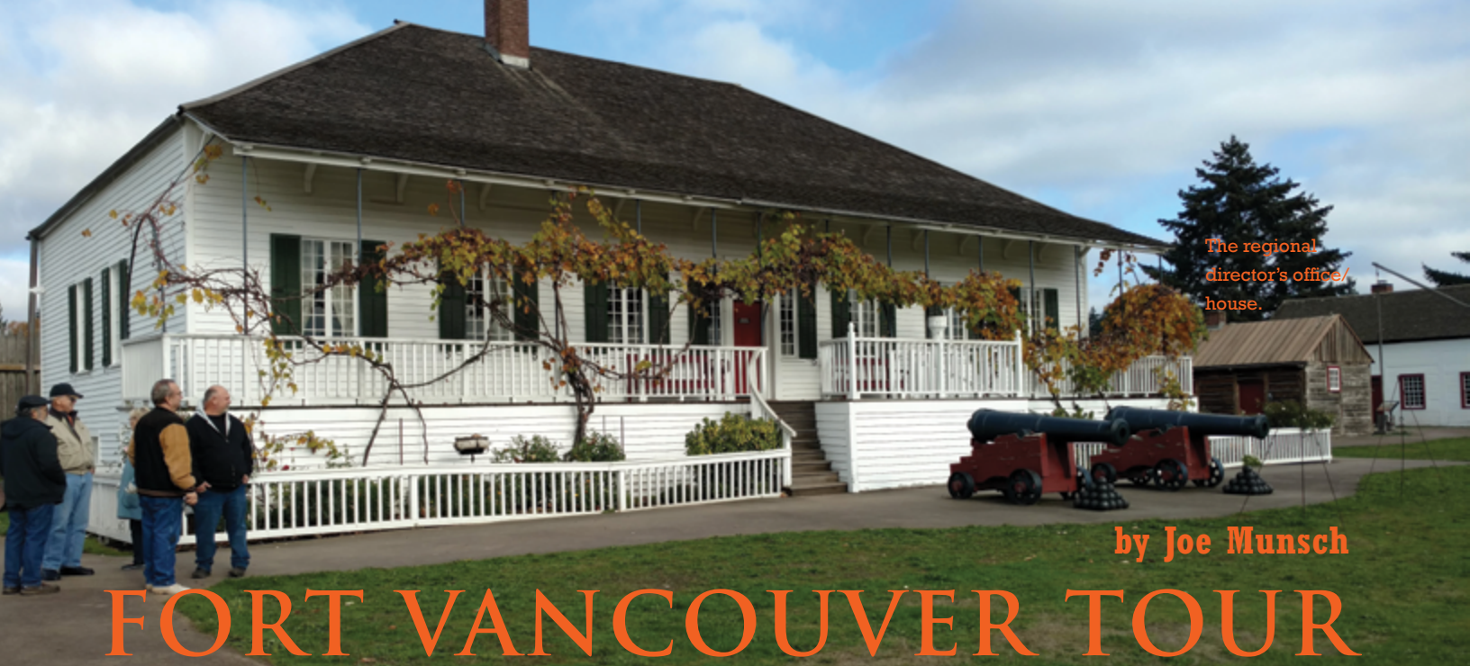
The regional director's office/house.