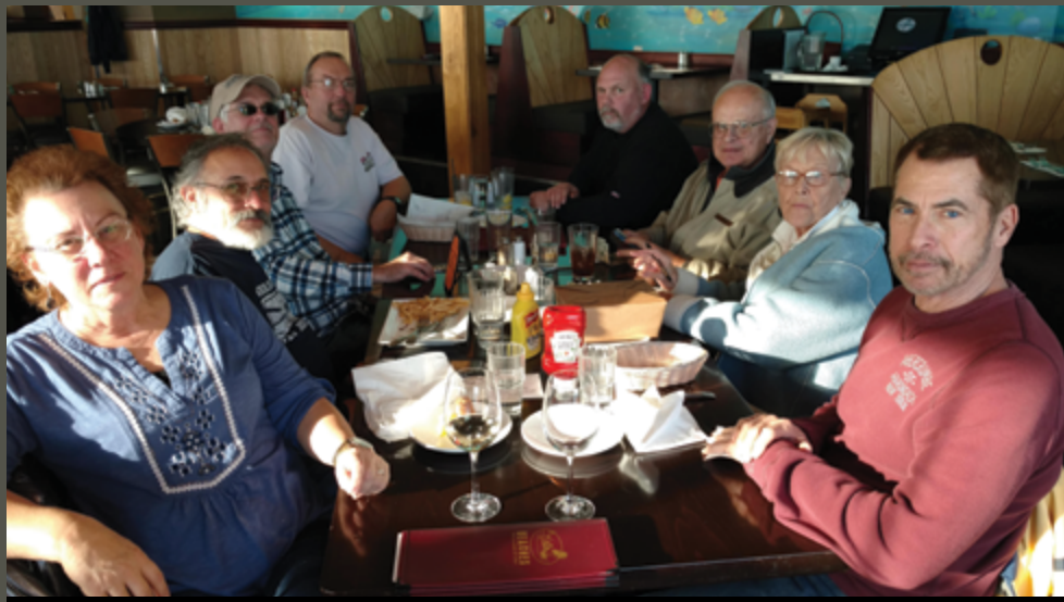
The whole gang.