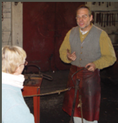
We learned about blacksmithing at the fort.