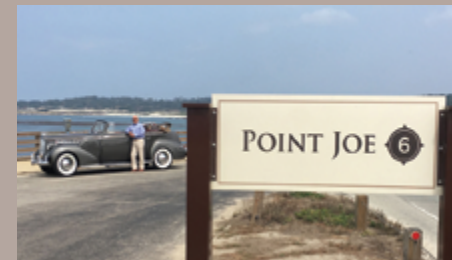
Point Joe on the 17-Mile Drive. That's how far away the parking seemed for some events.