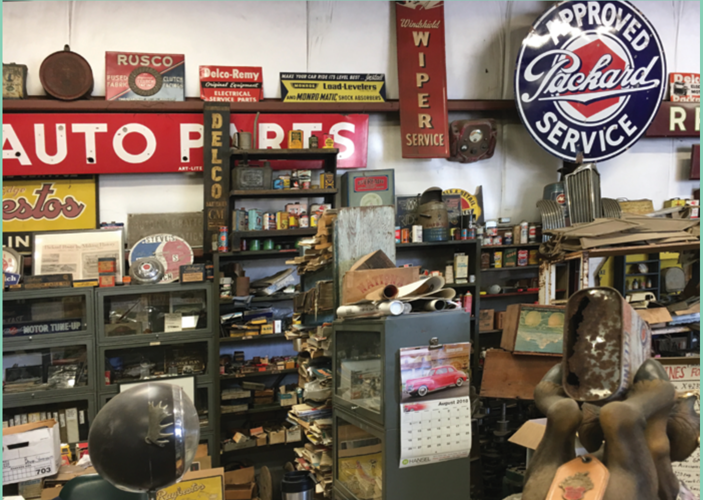
Easy to spend hours browsing at Moose Motors. Jeff has accumulated an impressive collection of signs and Packard memorabilia, too.