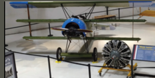
WWI-era Fokker DR-1 tri-plane (replica).