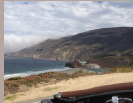
Hurricane Point on Hwy 1 between Big Sur and Carmel, a thrill twice a day.

The races at Laguna Seca were spectacular and noisy. The only Packard racing was a 1912 Model 30. Driving over the hills to find a parking spot was an adventure in itself.